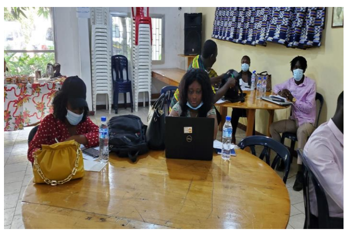
Cross section of Public Information Officers of Gov't Institutions at one of CEMESP & IIC Freedom of Information trainings in Monrovia